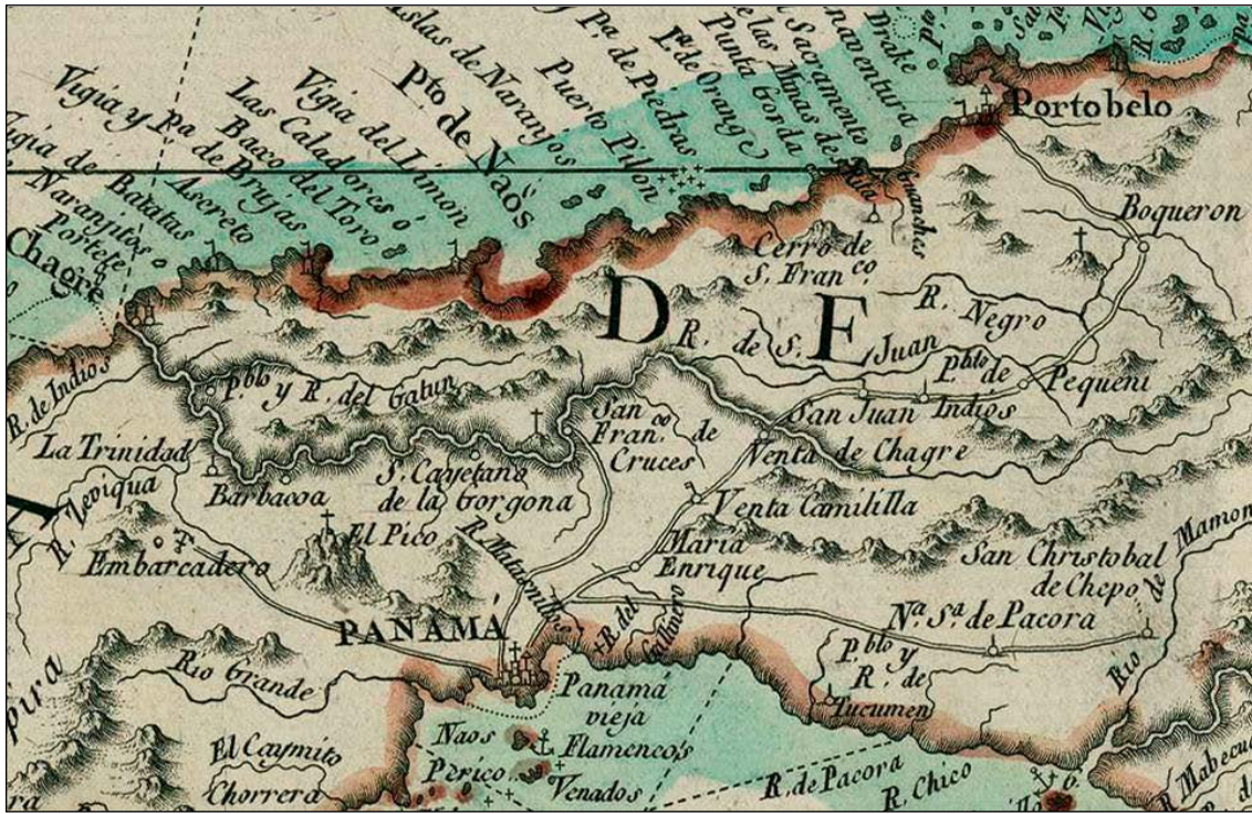
Figure 4. Fragment of Map of Tierra Firme or Castilla de Oro (Panama) in 1785, by Don Juan Lopez, showing the route of the Camino Real from Panama City to Portobelo, and the Chagres river.

The Camino Real is the overland trail that connected the terminal cities on both oceans across the isthmus, Panamá on the Pacific and Nombre de Dios on the Atlantic. Its passage was swifter but much more expensive than travelling along the Camino de Cruces – the cheaper, longer, safer, more comfortable and better historically known route – which connected the same destinations but through a mixed terrestrial and fluvial way along the Chagres river. They were both used from the third decade of the 16 th century onwards, when the Camino Real was simply an open path through the jungles until it was partially paved at the end of the century. 82 These trails were crucial in maintaining the commercial, tributary and political links between Spain and its South American empire, and witnessed the passing of over 60% of all the gold and silver taken to Europe in the 16 th and 17 th centuries, 83 especially so over the Camino Real which was designated as the only possible