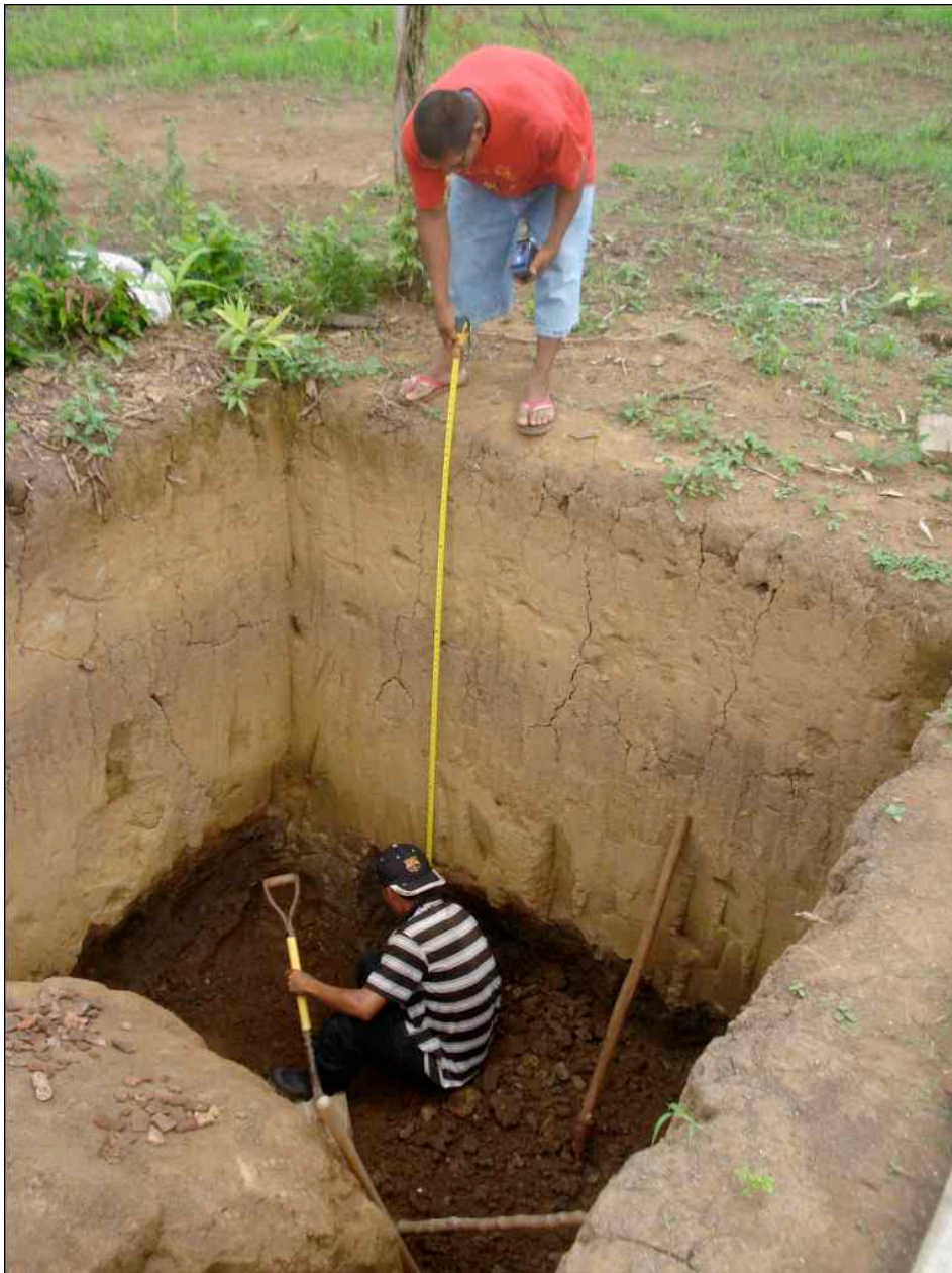
Figure 2. Five feet deep layer of ancient settlement in Tortuga, River Ucurganti.

assemblages, 63 64 even if the motifs seen in this sample were unknown or seldom seen, a fact which precluded a precise dating of the feature or the shreds.