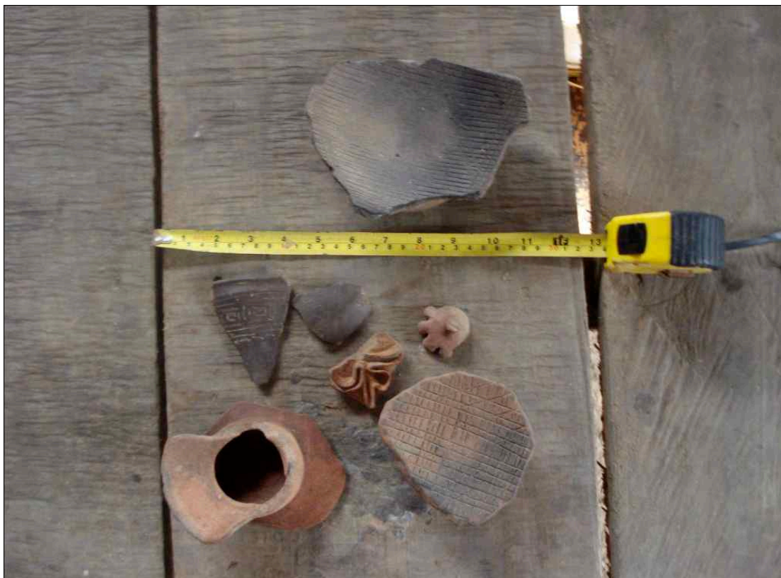
Figure 3. Ceramic fragments found at Rio Ucurganti.