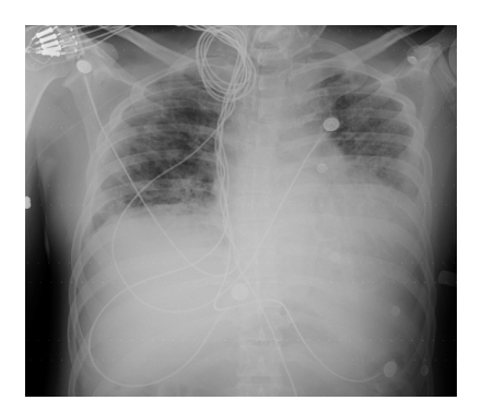
Figure 4. X-ray evolution from tracheotomy to hospital discharge on 01/14/2021.