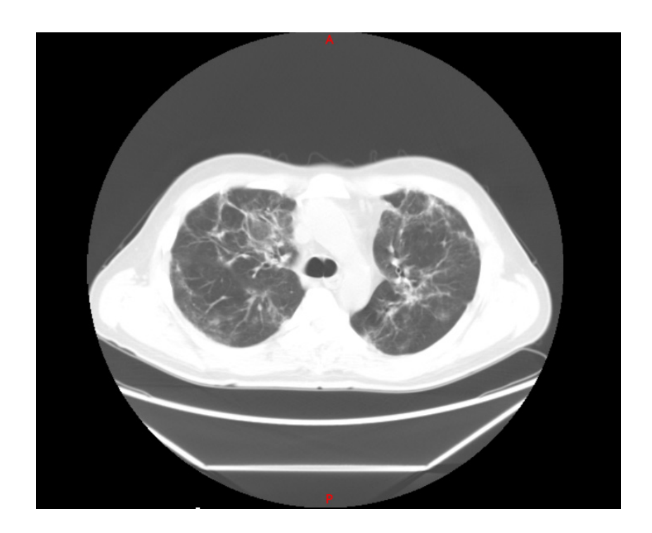
Figure 5. Post covid computed chest tomography scan (01/23/2021)