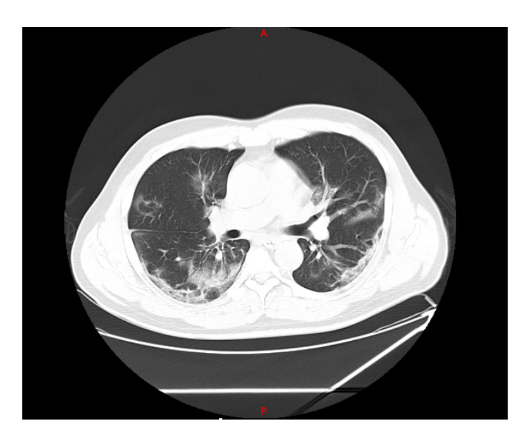
Figure 1. Computed chest tomography scan on admission (11/24/2020)