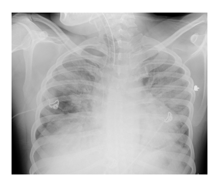
Figure 2. Chest X-rays evolution from admission to 11/28/2020