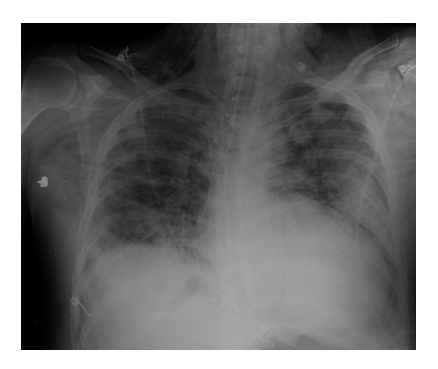
Figure 3. Evolution x-ray mechanical ventilation from 28/11/2020 to extubation on 10/12/2020.